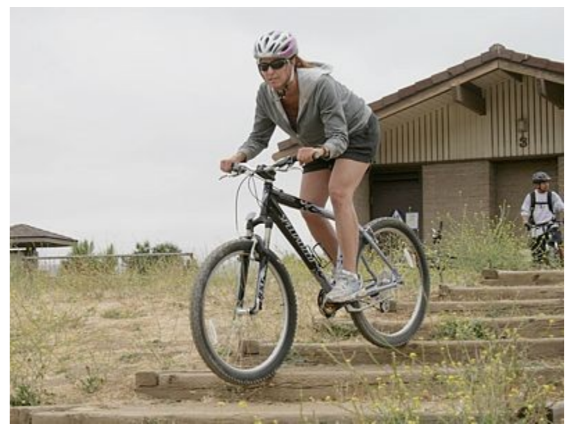
A student learns how to navigate multiple obstacles on the steps at Malibu Creek State Park during the July free Basic Skills Clinic. The next skills clinic is Saturday August 7th.